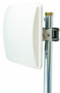
2.4GHz Weatherproof Directional Panel Antenna.